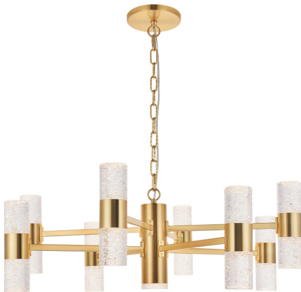
Gold Item No: 5200D32G